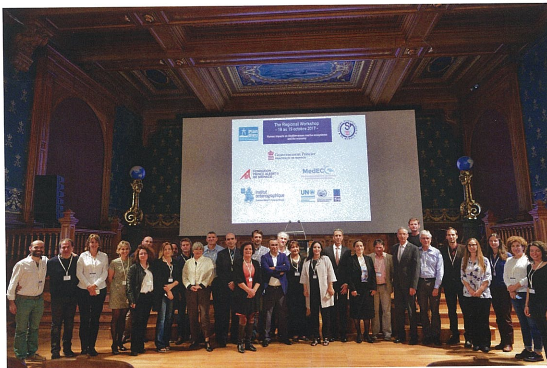
Participants of the regional Workshop on "Human impacts on Mediterranean marine ecosystems and the economy", Musée océanographique de Monaco, 17-18 October 2017

This document analyses the main threats, vulnerability and ecological and human impacts. On the consensus of a wide range of specialists in different disciplines then some responses and policy options as well as main knowledge gaps and needs are proposed as conclusions for Mediterranean decision makers.