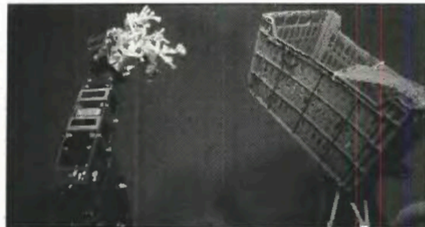
Collecting coral samples (above). Picture of litter disturbing the seabed (below left). Dendrophyllia coral (below)

The project commenced in December 2014 and the survey was conducted in the first week of June, in the coastal area of Protaras and Cape Greco funded by the TOTAL foundation.